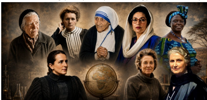
Ai-generated and colorized image shows (from top left) Dorothy Day, Marie Curie, Mother Teresa, Benazir Bhutto, Wangari Maathai, and from bottom left, Laura Montoya, Elisabeth Elliot, and Maria Montessori.

In Magnifica Humanitas, Pope Leo XIV highlights eight women from faith, science, education, and politics as examples of courage, service, and human dignity. Their lives remind us not to lose sight of our humanity in a world increasingly shaped by technology and efficiency.