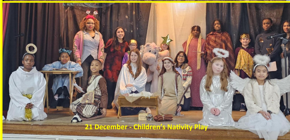
21 December - Children's Nativity Play