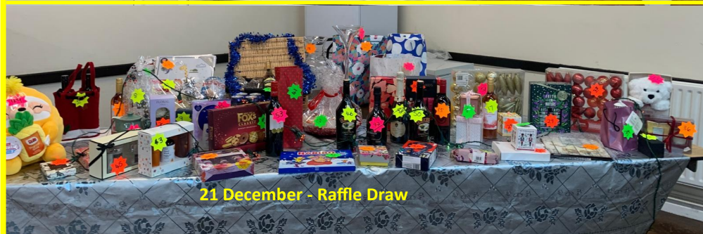
21 December - Raffle Draw