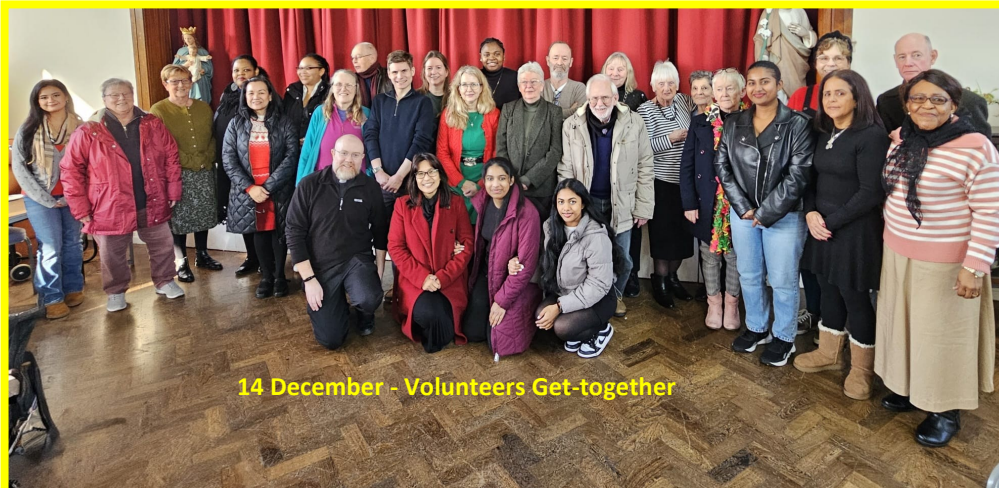
14 December - Volunteers Get-together