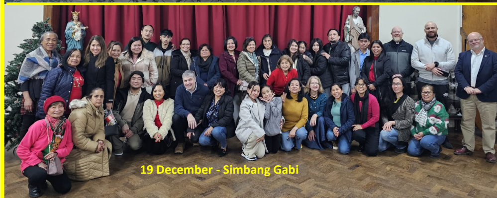
19 December - Simbang Gabi